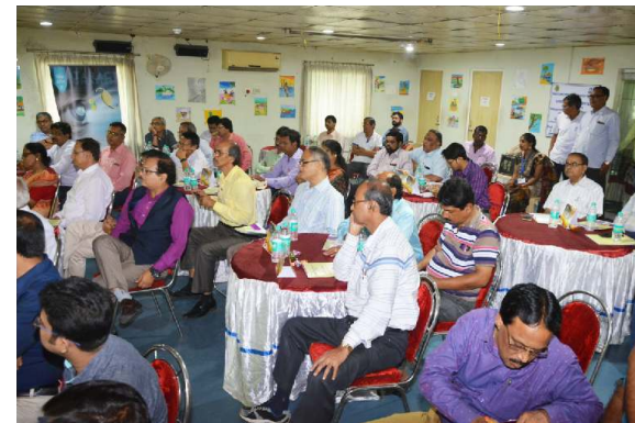
District Sight first Conclave