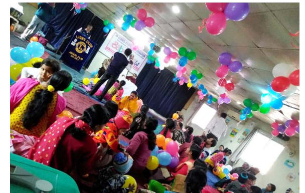
Annual Baby Show