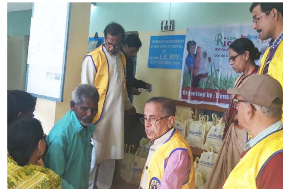
Rice Bag Challenge