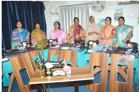
Free Sewing Machine Distribution Programme