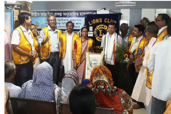
Doctor's Day Celebration