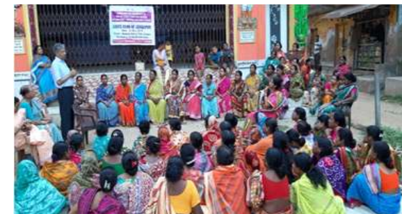
Women Empr. - Awareness program