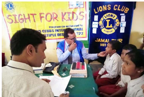
Sight for Kids Programme