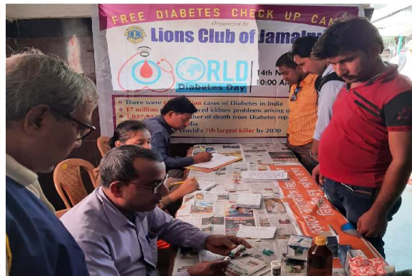
Diabetic Detection Camp